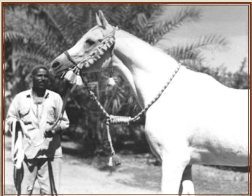
Nazeer (Mansour x Bint Samiha) 1934 grey stallion, the most transformational sire in Arabian breeding since the Polish stallion Skowronek. Though Hadban Enzahi by strain, even Nazeer traces to El Dahma, through his grandsire Gamil Manial.

and Sabah blood. The beautiful Bukra produced Bint Bukra at the EAO and also Ansata Bint Bukra imported to the U.S. by Ansata and, in combination with Ansata Ibn Halima's blood, founded a huge influence within Egyptian lines worldwide. Layla is revered as the female line of Europe's magnificent Tamria line, from the beautiful mare Kamar. Because the Sabah branch of El Dahma is connected to so many females it has helped El Dahma become perhaps the largest mare line within straight Egyptian breeding.