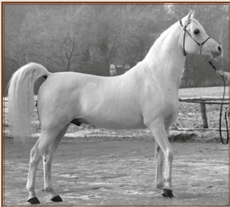
Madkour I (Hadban Enzahi x Moheba II) 1971 grey stallion representing the Farida line from the famous "M" family of Malacha. He is the sire of Jamilll.