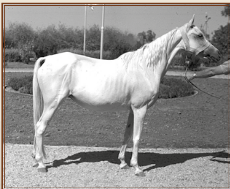
Kamar (Nazeer x Komeira) 1953 grey mare, a beautiful mare and another admired branch of the original El Dahma, via Layla.