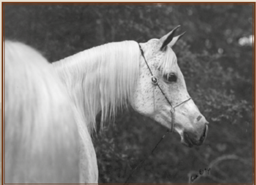
Fa Sherifaa (Ansata El Sherif x Faserrabba) 1985 grey mare representing the ideal blending of three famous lines to El Dahma, Ansata Ibn Halima, Ansata Bint Bukra and Bint Bint Sabbah.