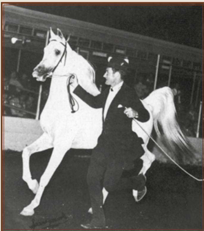
Morafic (Nazeer x Mabrouka) 1956 grey stallion, certainly the most exotic Nazeer son. Even though he is of the Saklawi Jidran strain Morafic carries 11 crosses to the original El Dahma, compared to Ansata Ibn Halima's 7 crosses.