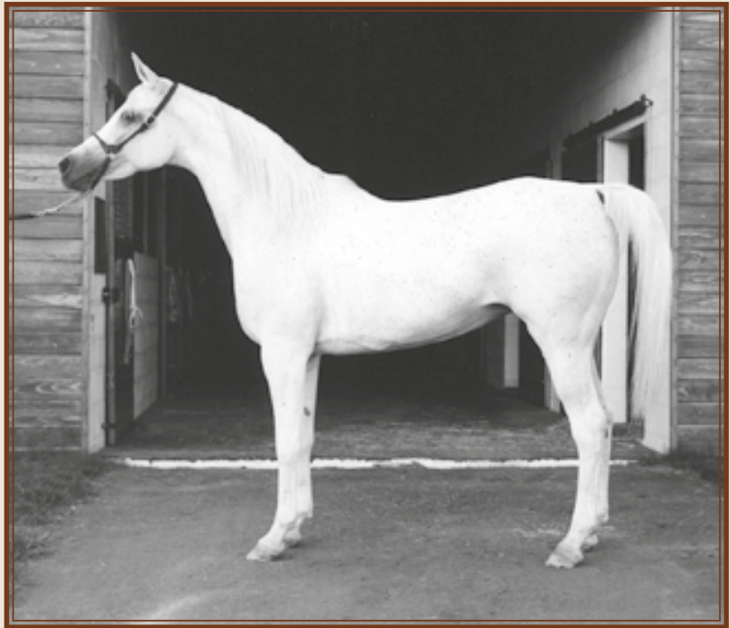
Ghazalahh (Mashhour x Bint Farida) 1951 grey mare, a truly magnificent mare founder of the Inas branch of El Dahma.

El Dahma's daughter Obeya is the grand dam of the mare Sabah (with 2 lines to El Dahma), who became one of the most prolific female lines to El Dahma via her three grand daughters, Bint Bint Sabbah, Bukra, and Layla. Bint Bint Sabbah, the aforementioned Babson import, produced seven daughters, many found not only in Egyptian lines but also in other American bloodlines. She is the dam line of International Champion Fa Halima (x Ansata Ibn Halima), just one beautiful example of the ideal matching of the Halima